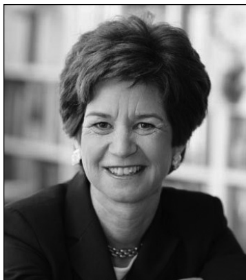
The Honorable Kathleen Kennedy Townsend