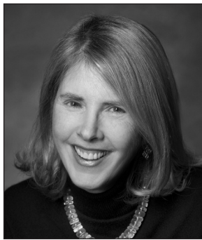
Kay Redfield Jamison, Ph.D.